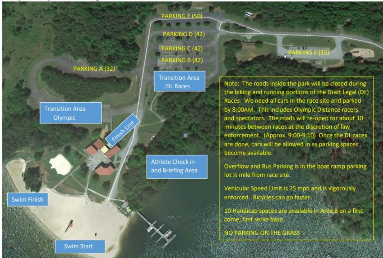
Liberty University Triathlon Parking