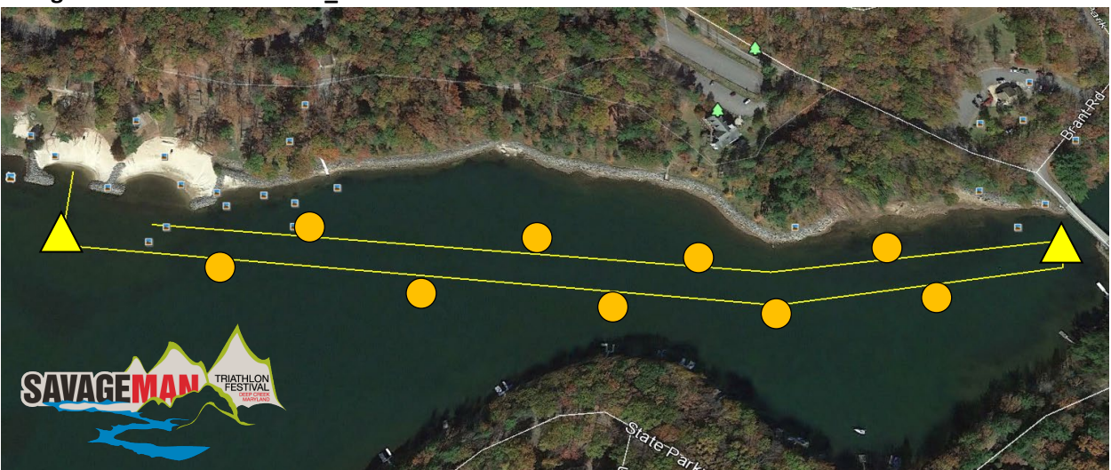
SavageMan 30.0 Swim Course_1500 Meters

Athletes doing the 30.0 will swim 1500 meters in the crisp, clear waters of Deep Creek Lake. Buoys will generally be on your right as you progress through the course. Yellow triangle buoys and turtles need to be kept on your right, orange round buoys are for sighting only and can be passed on either side. This is an in water start with a beach finish. The water temperature is expected to be in the upper 60's and an official temperature will be posted the Thursday prior to the race.