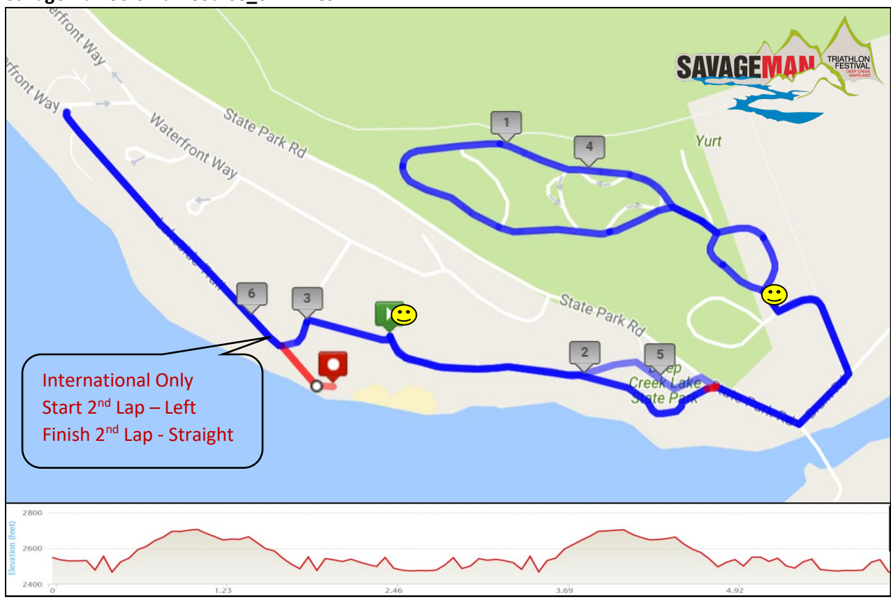
SavageMan 30.0 Run Course_6.2 Miles

The SavageMan 30.0 consists of 2 loops of the new 5K course. This course is flat along the lake with a challenging climb in the State Park campground that is done twice. The course is shaded throughout and the running surface is a combination of paved roads and packed gravel trails. Water and a sports drink will be available every mile.