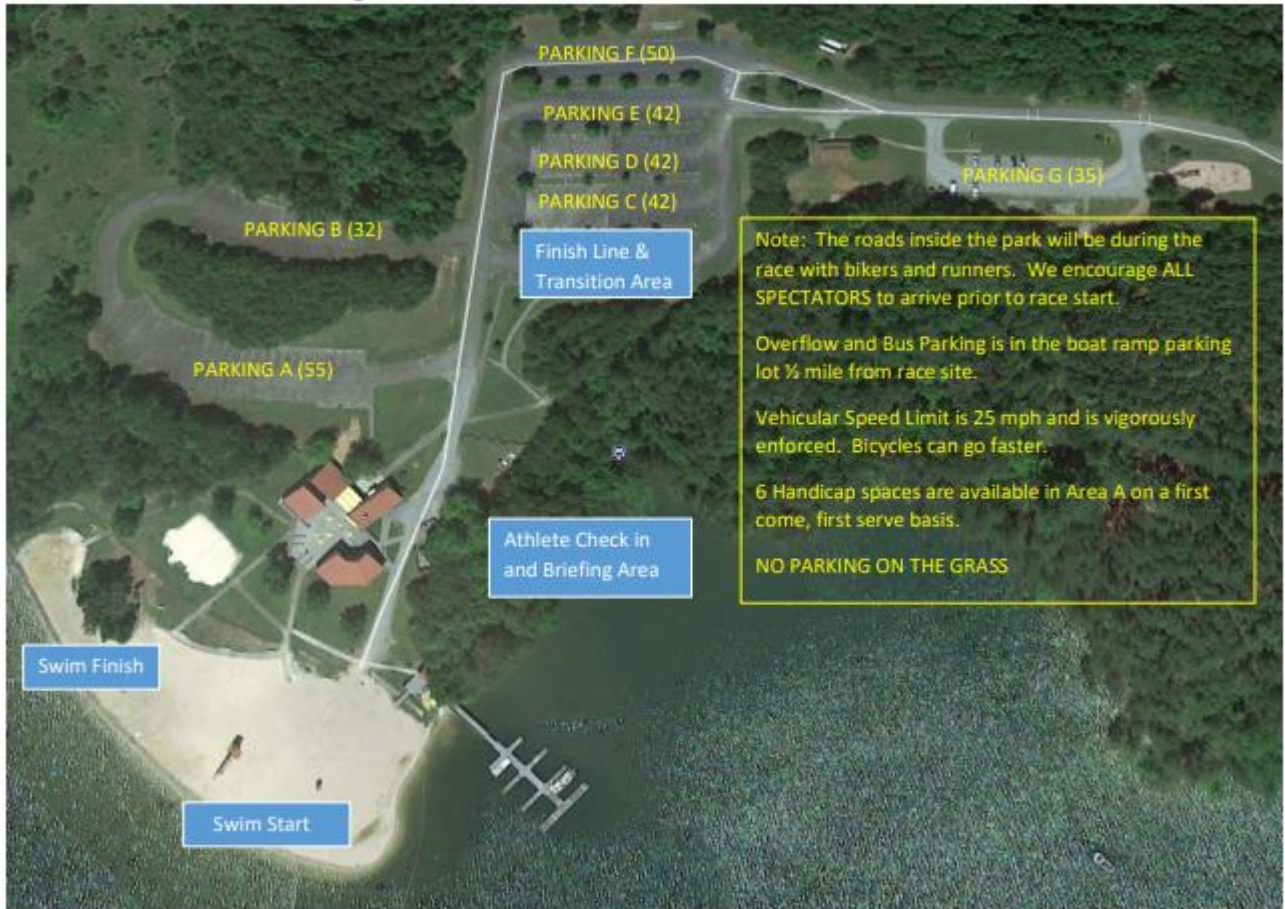
Smith Mountain Lake Triathlon Parking

Parking is available inside the state park in the lots surrounding the Beach Area. If you feel you may have to leave early please park in the marina parking lot.