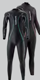
RACE TRIATHLON WETSUIT PERFORMANCE-LEVEL