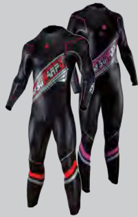
VANGUARD TRIATHLON WETSUIT COMPETITION-LEVEL