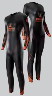
VICTORY TRIATHLON WETSUIT TOP-LEVEL