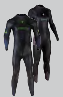
N-JOY TRIATHLON WETSUIT ENTRY-LEVEL