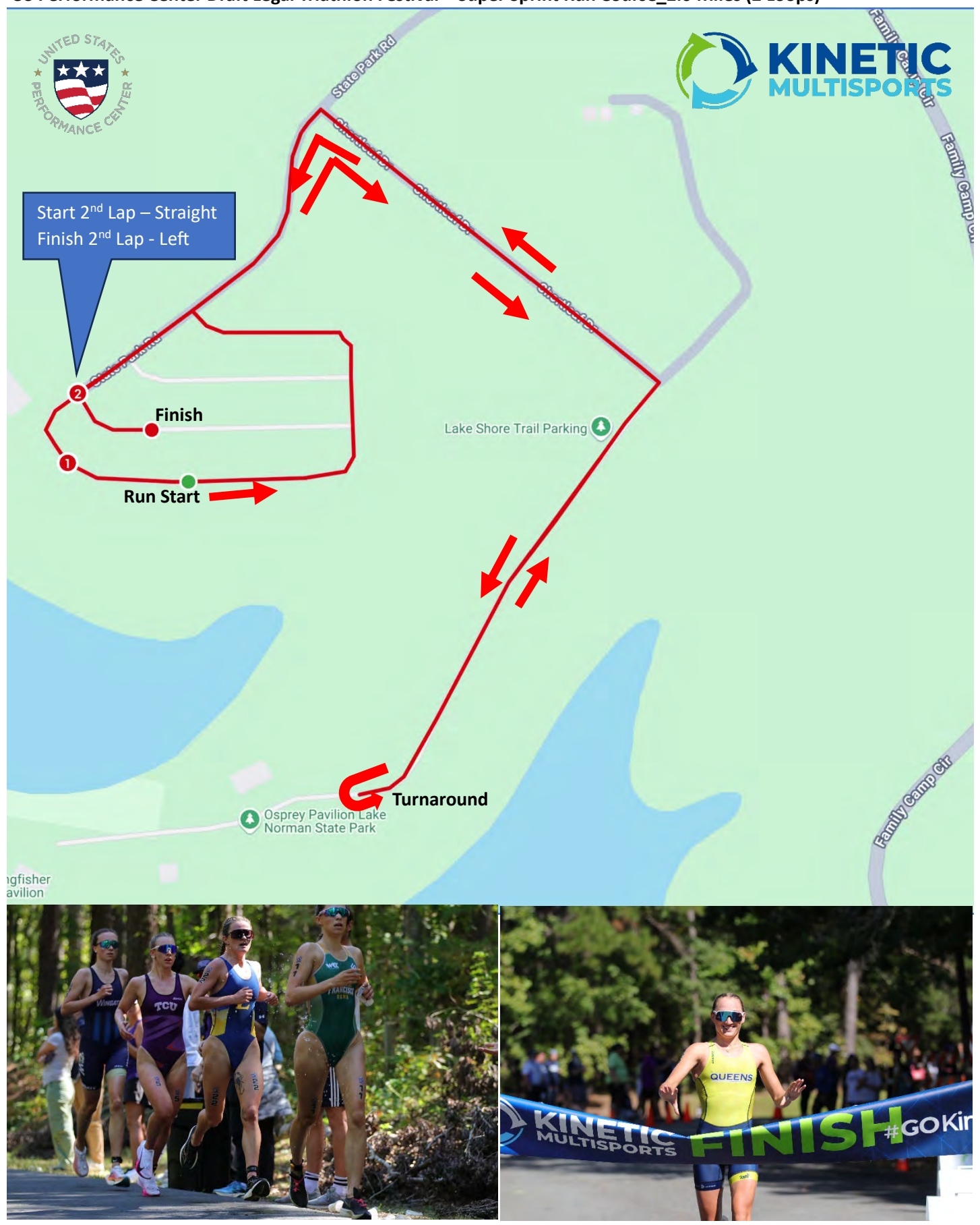
US Performance Center Draft Legal Triathlon Festival – Super Sprint Run Course_2.0 Miles (2 Loops)